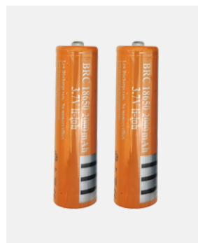
2 LITHIUM-ION BATTERIES Type 18650