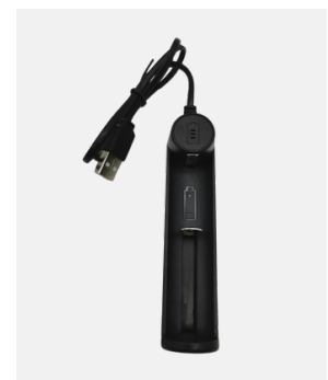
USB CHARGER For Battery Type 18650