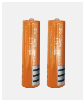
2 X 18650 ERSATZ-AKKUS Art. 264 Suitable for MR 96 E