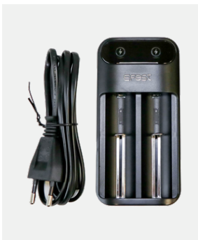
CHARGER Forr 2x Li-Ion Battery (Charging time 4 hrs.)